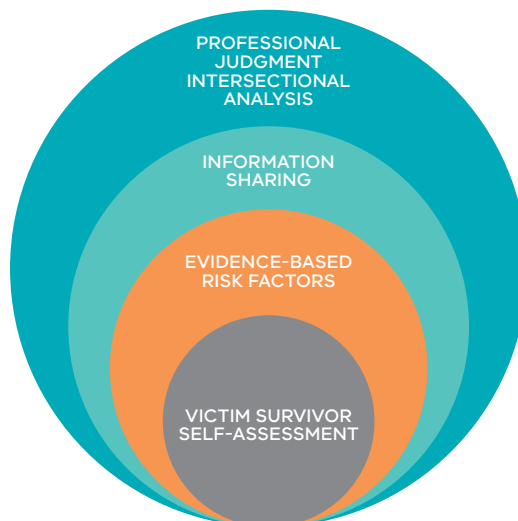
Figure 2: Model of Structured Professional Judgement

This section describes the elements of risk assessment and the sources of information you might use to inform a risk assessment and how to determine the level of risk. Guidance on intersectional analysis as part of professional judgement is contained in a further section.